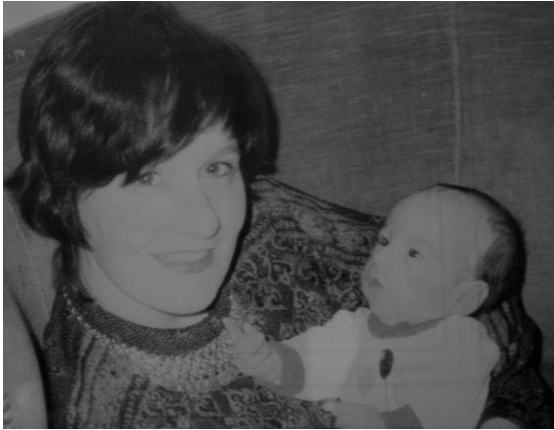
Photo 5. Mother and birth of second son.

representation of time. And I may go through time, that is my way, I am not suggesting anything of course, it is just my experience.