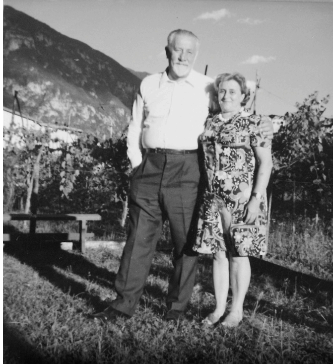
Photograph 4. Parents of the second author.