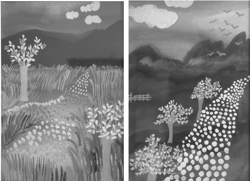
Photographs 2 and 3. Untitled watercolors by Fiorella Minati (1980).

GM: Exactly. I think abstracting is a way to be free. It is a way to build meaning. Nothing to do with the truth, you know. Do you see the two paintings by my wife (Photographs 2 and 3)? She made several. Do you see they go to an end point? You see, she had the same attitude.