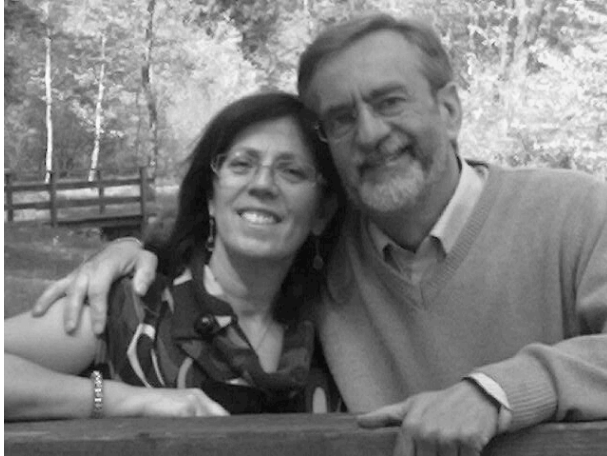
Photograph 7. Second author with companion.

(Photograph 8). It is a metaphor for me that inspires me to health as my creative living and creative living as my health.