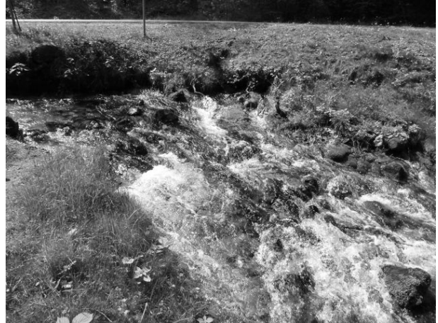
Photograph 8. Metaphor for health as creative living and creative living as health.