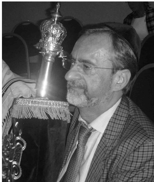
Photograph 1. The Torah, held by the second author, a source of direction for life and living.

GM: The quotations are something very important to me, they are from books of Torah (Photograph 1). They are introduced to show the implicit knowledge, how the quotations are a way to understand what I introduce and how they give shape to my story, in my view, of course.